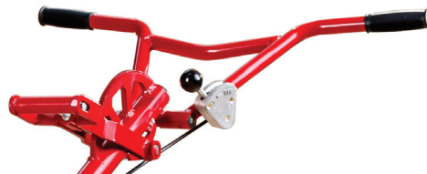
Rapid pitch handles use a ratcheting action to provide easy adjustment with the push or pull of a lever.